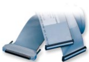
Figure 10. R1005050 Ribbon Cable