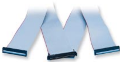
Figure 12. NB5 Cable