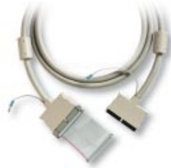
Figure 8. H50-50 Shielded Cable

2 boards .....776249-02 3 boards .....776249-03 4 boards .....776249-04 5 boards .....776249-05 Extended, 5 boards .....777562-05