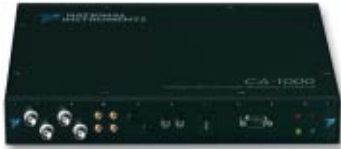
Figure 3. CA-1000 Configurable Signal Connectivity Solution