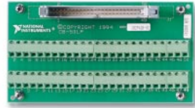
Figure 6. CB-50LP I/O Connector Block

CB-50LP.....777101-01 Dimensions – 13.26 by 7.19 cm (5.22 by 2.83 in.)