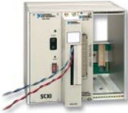
Figure 1. SCXI High-Performance Signal Conditioning