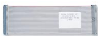
Figure 11. NB1 Cable