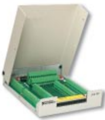
Figure 4. SCB-100 Shielded Connector Blocks