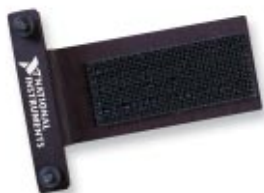
Figure 14. PCMCIA Strain-Relief Accessory