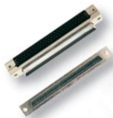
Figure 13. PCB Mounting Connectors