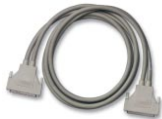
Figure 9. SH100-100-F Shielded Cable