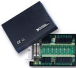
Figure 2. Digital Signal Conditioning Accessories