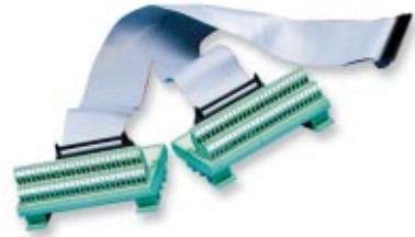
Figure 7. B-100 I/O Connector Kit

CB-100 with 1 m R1005050 cable .....777812-01 CB-100 with 1 m NB5 cable.....776455-02